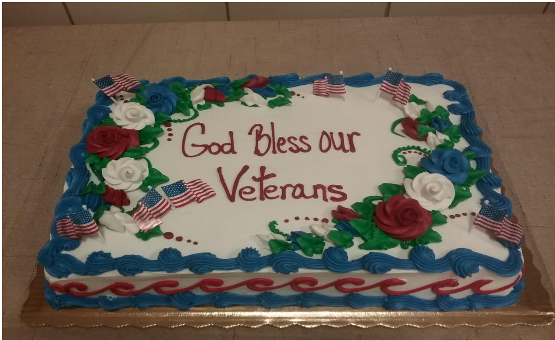
VETERANS DAY CELEBRATED AT FAITH ON NOVEMBER 10-11, 2018